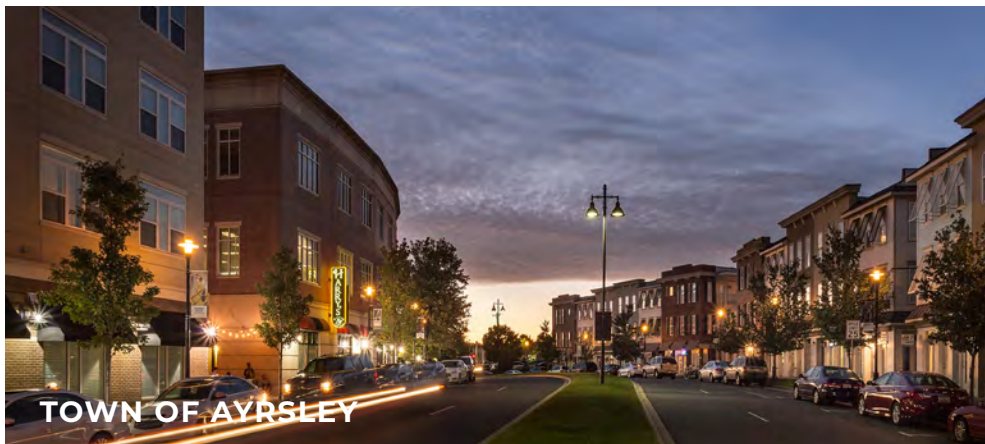
TOWN OF AYRSLEY