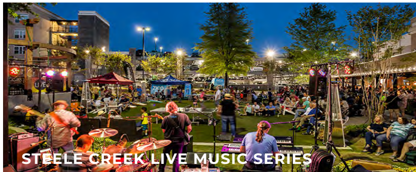
STEELE CREEK LIVE MUSIC SERIES