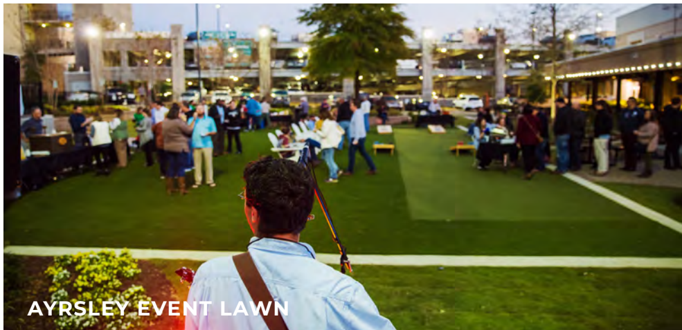
AYRSLEY EVENT LAWN